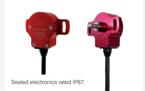
Sealed electronics rated IP67.

This lightweight device is well-suited to Automotive, Motorsport, Industrial, Off-Highway, Defence and UAV applications.